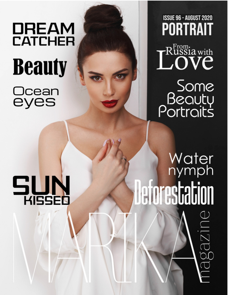
Marika Magazine editorial 08/2020